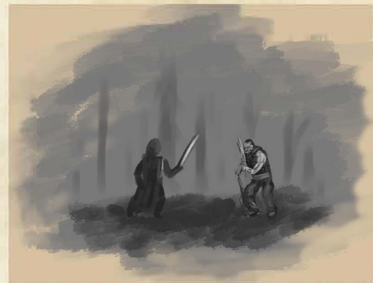
"The Honor Duel"